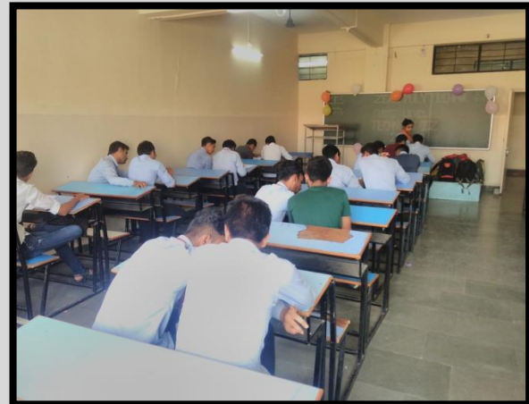
Photos for Quiz Session

After judging all the participant according to our Hon. Judges result was declared on the same date in Prize Distribution ceremony.