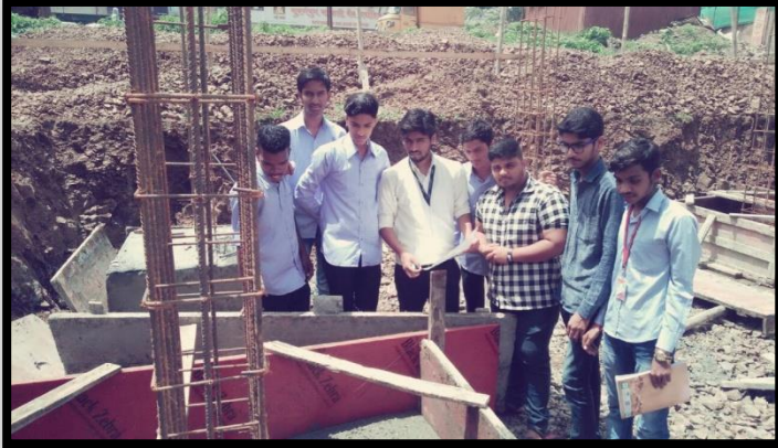
Field Visit at Foundation under construction

As a part of curriculum, Department periodically organizes a technical field visits to reputed industries and firms to enhance the practical knowledge of students.