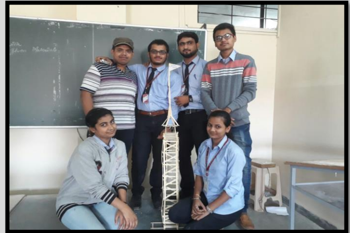
Third Year Students with their models.