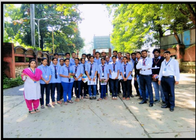
Field Visit at Water Treatment Plant