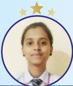
PISE SANIKA KISAN